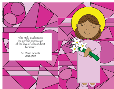
"The Holy Eucharist is the perfect expression of the love of Jesus Christ for man." ~ St. Maria Goretti